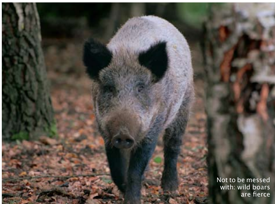
Not to be messed with: wild boars are fierce

British salami-fanciers, though, aren't quite as enamoured of boar meat as people on the Continent are. Perhaps because the wild boar was hunted to extinction here 300 years ago, we've lost our taste for it,