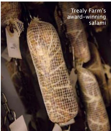
Trealy Farm's award-winning salami

• Other Trealy products are available from delis and food shops throughout the UK, and online at trealy.co.uk and rivercottage.net .