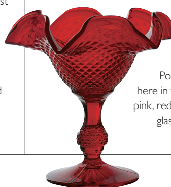
ILLUSTRATION BY LUCY VIGRASS

Irresistibly pretty 'fin de siècle' sundae glasses made in Portugal are now available here in four colours: clear glass, pink, red and blue. ICTC sundae glasses, £9.25 each (01603-488019; ictc.co.uk).